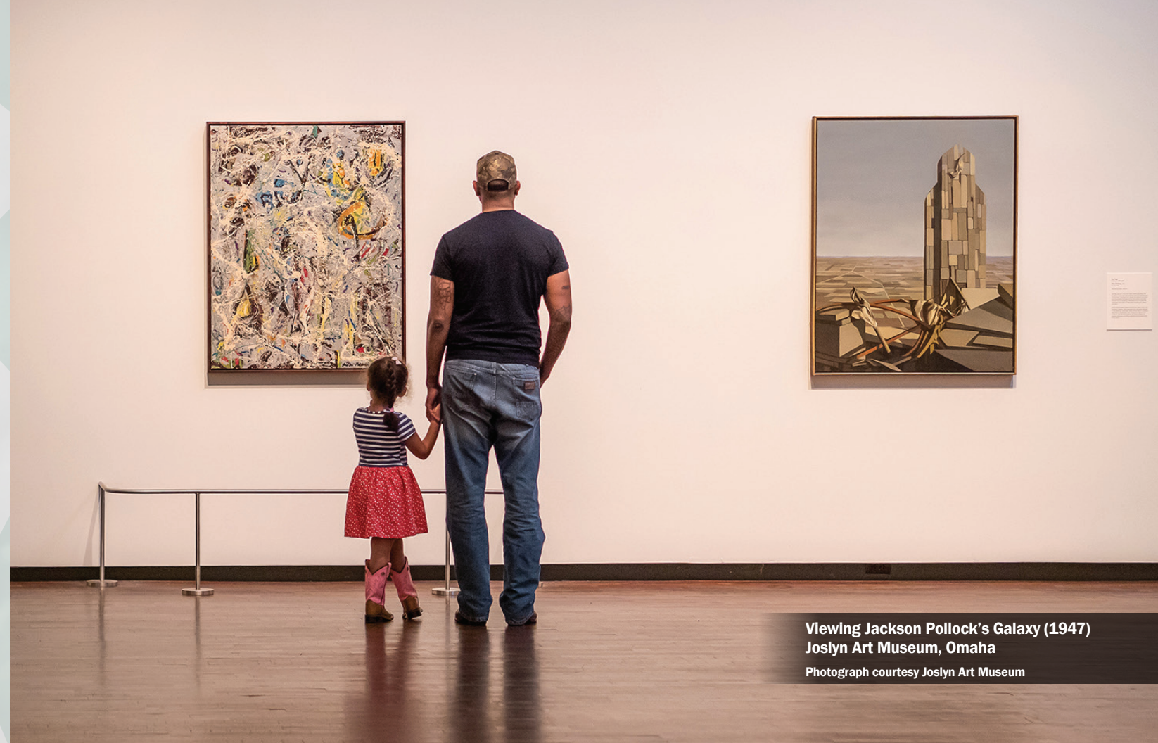
Viewing Jackson Pollock's Galaxy (1947) Joslyn Art Museum, Omaha